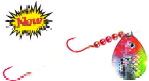
New Baitfish-Image Spinner Harness Colors Are Now Available

Crappie fishing continues to be excellent. We have been finding them near their spawning areas but schooled up out over the first break in deeper water. A crappie minnow on a plain hook or Northland Pan Fish Tubes are producing best