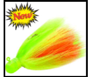
New Bug-A Boo Finesse Jigs With Hand-Tied NaturesEdge Marabou Feathers

one of my favorite ways to fish. You just never know what is going to be on the end of your line. It also gives me time to experiment with different kinds of presentations. I would have to say that Northland's new Bug-A Boo